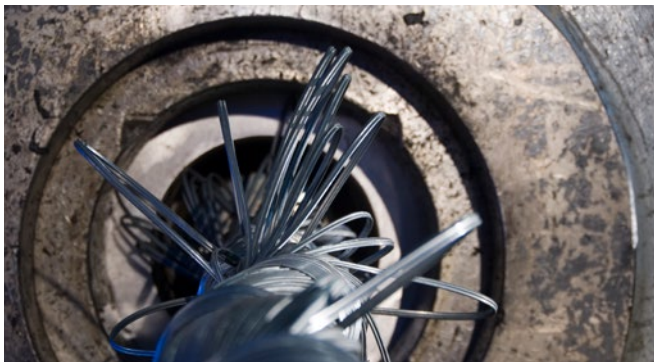
DMT Rope Testing