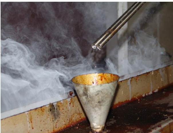
Test aerosol in use according to UL 1046 testing

In centrifugal separators it is predominantly the inertial force of the particles in a moving gas stream that is used for separating the aerosols. The vapour and aerosol separators in kitchens are deflecting separators, which steer the air stream into manifolds or around obstacles (e.g. deflector plates) so that the particles' inertia causes them to leave the streamline. The effect of the inertial force can be increased by gravitational pull. Centrifugal separation refers to applications in which the centrifugal force caused by radial deflection, such as in a cyclone, is utilised to separate the particles.