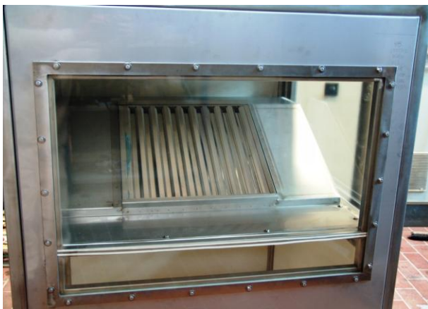
Vapour/aerosol separator in DIN 18869-5 test rig

Because the inertial force is proportional to the particulate mass, but the mass is cubically proportional to the radius ( r^3 ), as the particle size is reduced, the inertial force can drop significantly. Diffusion force only begins to affect separation if the particles have a size of 0.1 \mu\text{m} or below, meaning it is difficult to remove very fine aerosol particles using an aerosol separator. Firstly, a very rapid airflow is necessary and/or the airstream must be drastically deflected in order to enable effective inertial separation. Further disadvantages are the higher noise levels and the increase in energy consumption due to the loss in differential pressure. On the other hand, if the speed of the airstream is too great, the already separated liquid could be pulled away from the walls.