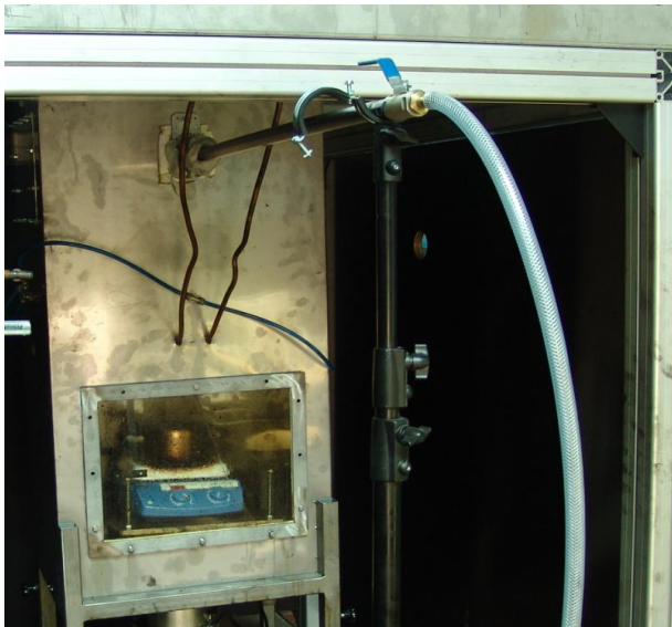
Taking an aerosol sample during testing according to LPS 1263 standard

Some more intensive investigations on the gas-phase composition of kitchen fumes do exist [2, 4], – namely concerning the gaseous products of kitchen processes, their mass rate and distribution in the kitchen – however, knowledge on the efficient reduction of kitchen fumes is severely lacking.